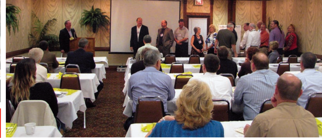
Introduction of suppliers