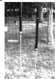
Holland Heavy Duty Probe

INDIANA CEMETERY ASSOCIATION, INC. www.indianacemeteryassociation.org