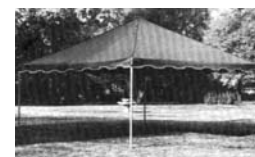
15' x 15' Holland Tent

E-Mail: sales@hollandsupply.com or www.hollandsupplyinc.com