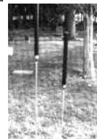
Holland Heavy Duty Probe