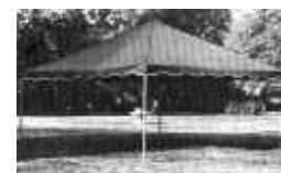
15' x 15' Holland Tent